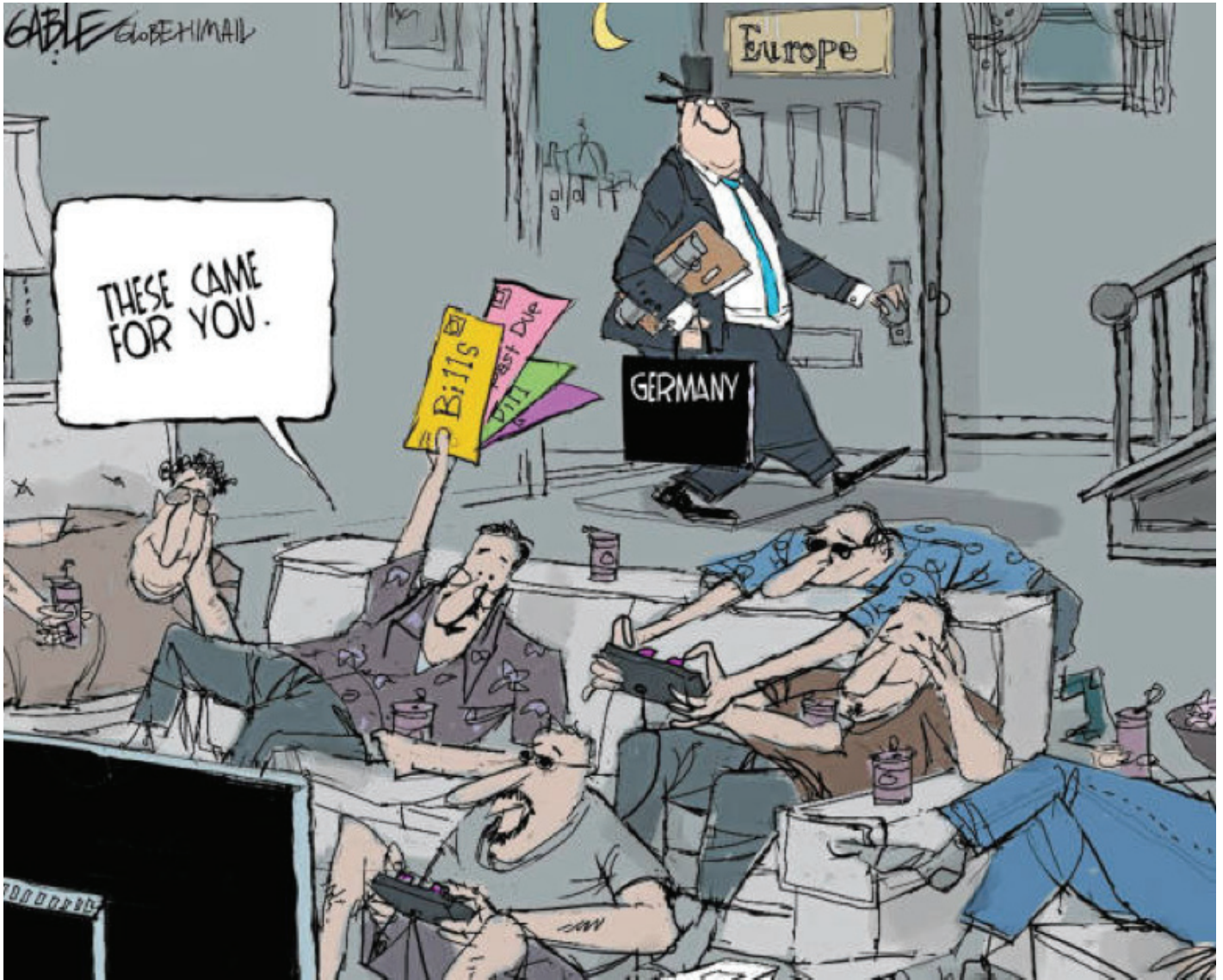
BRIAN GABLE JANUARY 6