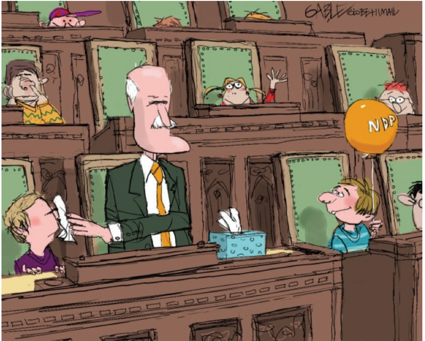
BRIAN GABLE MAY 5